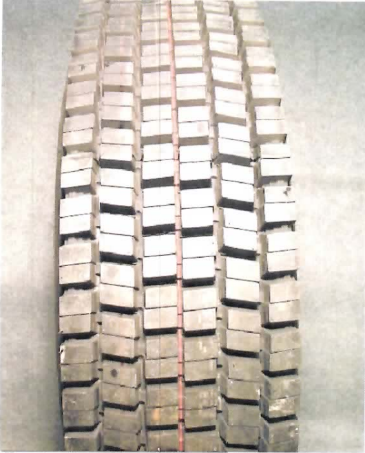
Tread pattern of candidate